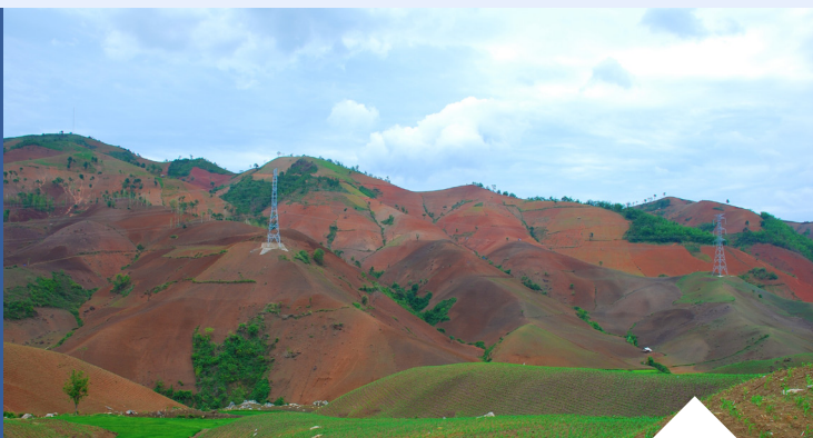
Expansion of agriculture area in Northwest Viet Nam.

28 percent of its forestland between 1976 and 1989. Between 1961 and 1989, Thailand's agricultural land increased by 13.12 million ha, while its forest area fell by 13.6 million ha (Cropper et al. , 1999). In some GMS countries agricultural expansion has been aided by government allocations of large concessions to foreign investors. Meanwhile, challenges in establishing plantations have exacerbated conversion of natural forest areas in Myanmar.