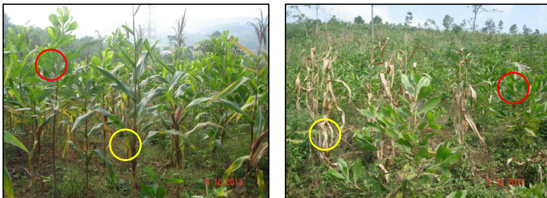
Fig. 4. Acacia mangium + maize agroforestry system. Yellow circles indicate maize and red circles indicate A. mangium trees