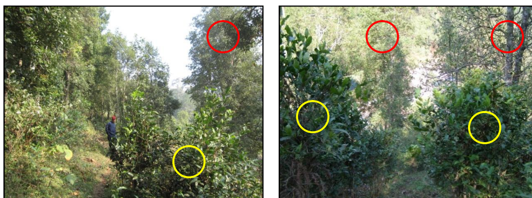
Fig. 1. Illicium verum +tea agroforestry system. Yellow circles indicate teas and red circles indicate I. verum trees