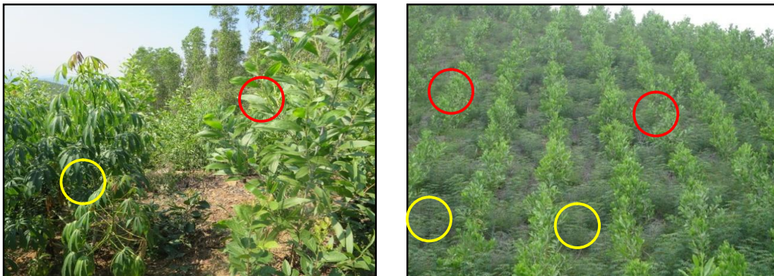
Fig. 3. Acacia hybrid + cassava agroforestry system. Yellow circles indicate cassavas and red circles indicate A. hybrid trees

however, is that these agroforestry systems are often established and expanded through farmers' own efforts without directive or government support, leading to no clear market strategy for agroforestry products [15]. During the establishment, the price of products is high, but usually decreases as a result of oversupply and also because farmers do not have marketing contracts with buyers. In some cases, farmers are not able to sell their products, which led them to abandon or shift their practices. Clearly, agroforestry investment is constrained by lack of stable markets. This issue calls for three important actions by local governments as follows: (i) Mediating between farmers and companies/exporters to develop a clear marketing strategy or agreement; (ii) Facilitating planning with farmers as to the areas that can be legally planted to or converted to agroforestry; and (iii) Providing technical and financial support to farmers [16].