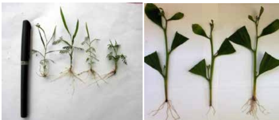
Fig. 5. Acacia hybrid tissue culture plantlets (left) and cuttings (right) Note: Tissue culture plantlets have bipinates, pimates and phyllodes whereas the cuttings just have phyllodes (picture from Doan Thi Mai).

Tissue culture in acacia hybrids reported by Darus using basic Murashige and Skooge (MS) medium supplemented with 6-Benzylaminopyrine (BAP) 0.5 mg/l for shoot multiplication and river sand for rooting, obtained a 70% rooting rate [5, 6]. In Vietnam, tissue culture propagation was first studied by Nguyen Ngoc Tan, et al. [23], and studies were continued by Doan Thi Mai, Ngo Minh Duyen, Le Son, and others (Fig. 5).