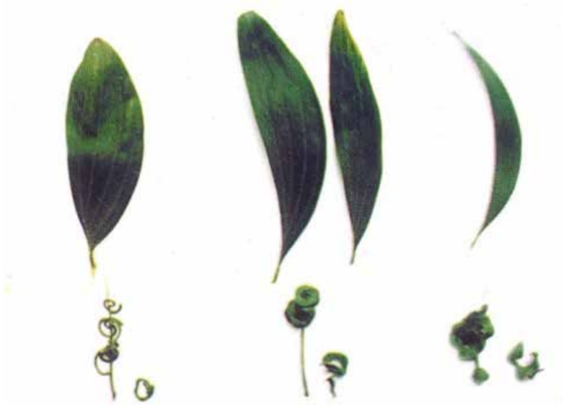
Fig. 1. Phyllode (above) and young pod (below) of A. mangium (left), acacia hybrid (middle), and A. auriculiformis (right).