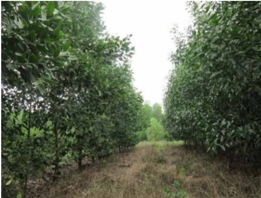
Fig. 4. Acacia hybrid triploid and BV16 (15 months) at Song May commune (picture from Nghiem Quynh Chi, 2015).

Three different fertilizer treatments that were applied before planting consisted of 2 kg of cattle manure + 100 g superphosphate; 2 kg of cattle manure + 300 g NPK (5:10:3), and 6 kg of cattle manure that indicated that in Ba Vi, acacia hybrid stem volume increased by 63-119% compared with a control sample (no fertilizer) at a three year-old plantation. Treatment of 2 kg of cattle manure + 200-300 g superphosphate increased volume by only 20% over the control [8]. Although fertilizers, such as NPK and superphosphate, that incorporate phosphorus increased growth rate of acacia hybrids in the first one to three years after planting, and the addition of a large dose of P does not greatly increase wood yield of acacia hybrids over a full crop rotation, as shown by the results of more recent experiments in Binh Phuoc [22] and Quang Tri.