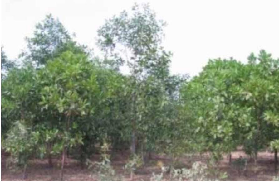
Fig. 3. Segregation of F_2 acacia hybrid seedlings exhibits the morphology of A. mangium , A. auriculiformis , and others.