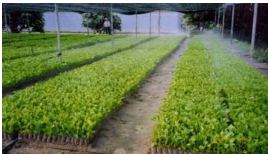
Fig. 6. Cuttings area of acacia hybrids with mist sprinklers in Binh Dinh.

At present, the package of acacia hybrid germplasms and propagating technologies have been transferred to many forest tree production units, leading to a