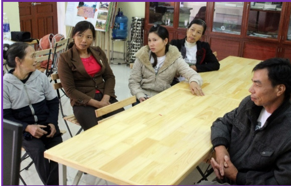
Photo 3. Focus group discussion.

was also held at the village meeting room; one of the technical project staff was present to take notes of the discussion. The farmers for the FGD were invited by the village leader. This may have coloured the selection process to some degree, but the purpose was not to have a statistical representative group of non-participating farmers; rather to obtain some initial feedback from non-participating farmers.