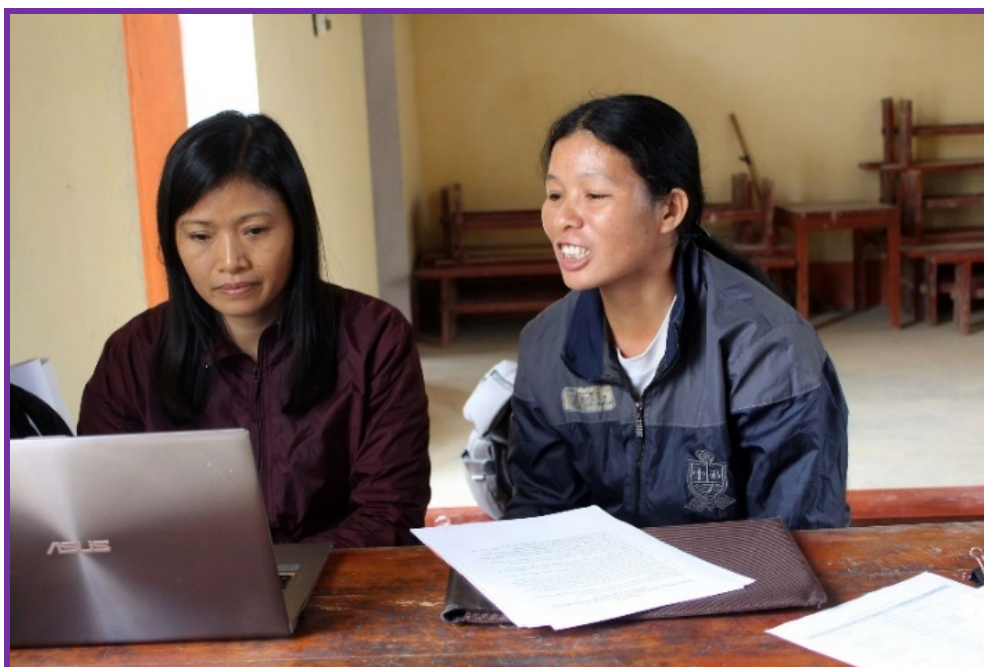
Photo 2. Interview with ma village farmer.

presence of project staff. Each interview lasted between 30 and 45 minutes. Interviewees were selected from the list of experimenters representing all the CSA options being tested. Interviews were held at the village meeting hall. One limitation of this venue was that the actual experiments could not be observed.