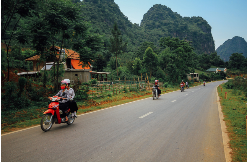
Motorcycles on rural road, Vietnam.