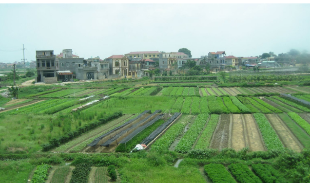
Rural Viet Nam