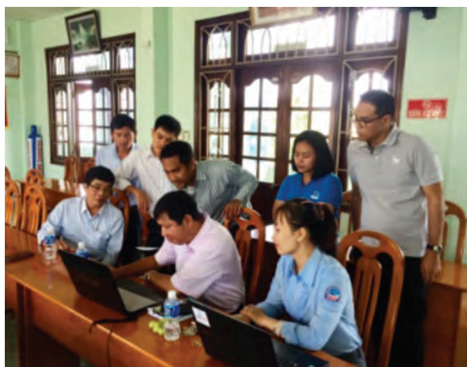
Figure 6. Demonstration of eACDS applications in Viet Nam