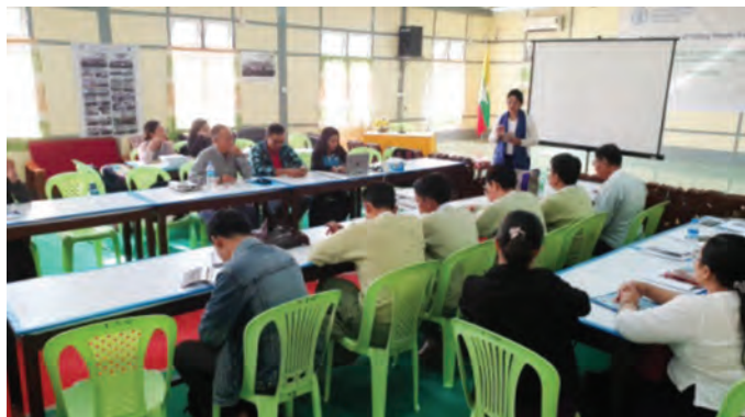
Figure 5. Demonstration of eACDS applications in Myanmar

of the JTF for the implementation of activities related to coordination, facilitation, development, and expansion of the eACDS under the five-year plan (2020-2024) of the project “Strengthening Regional Cooperation and Enhancing National Capacities to Eliminate IUU Fishing in Southeast Asia.”