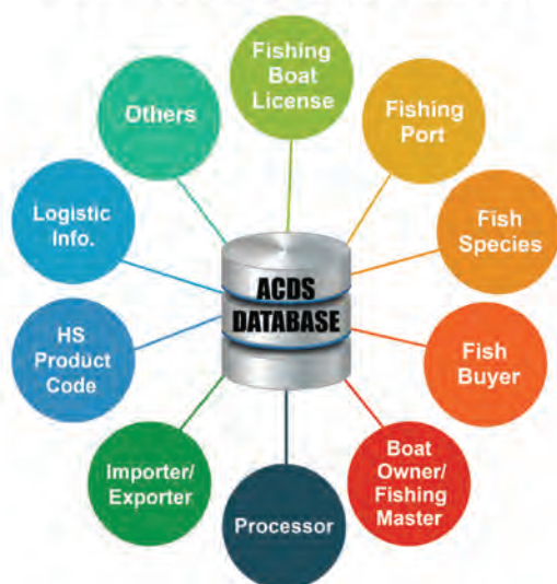
Figure 3. Key data elements required for the eACDS software