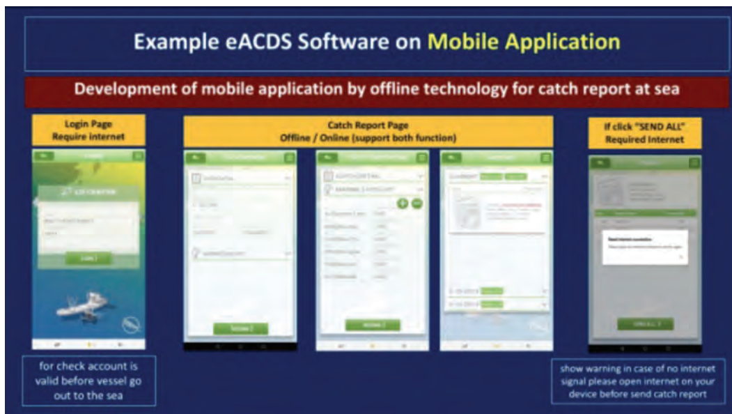
Figure 2. The eACDS software on mobile application