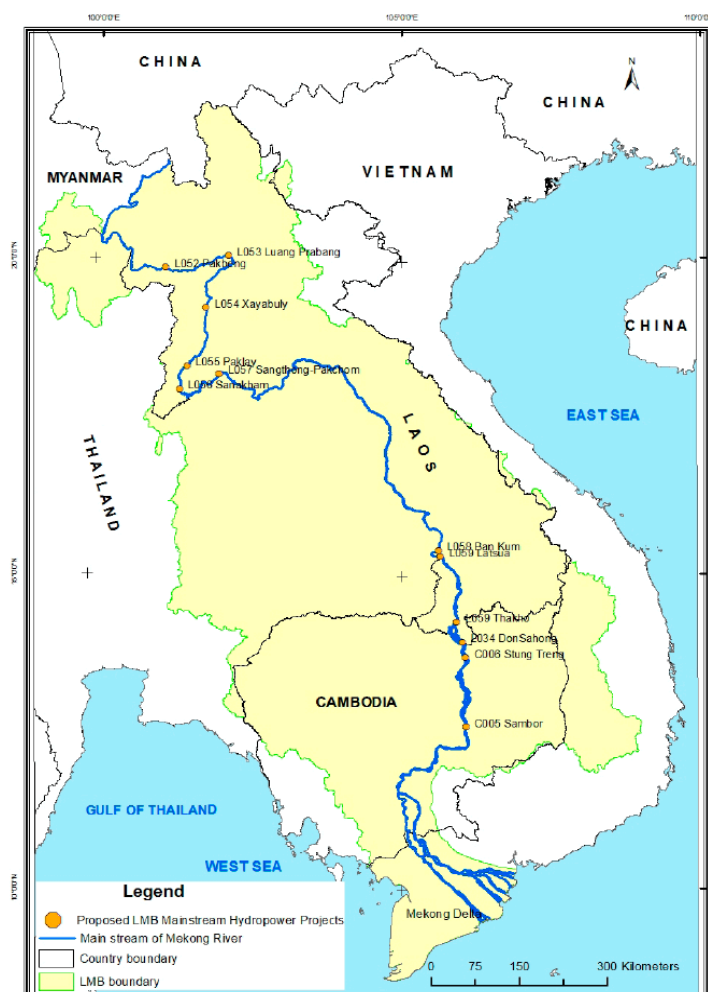
Figure 1. Location of proposed Lower Mekong Basin (LMB) mainstream hydropower projects [21].